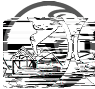
DRR and CCA