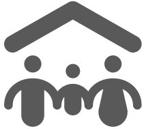
RCI and RPG